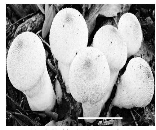
Fig. 1. Fruiting body (Bar = 3cm)

During a survey of District Gilgit, specimens of Lycoperdon were collected from a dence conifer forest in Nultar area (alt: 3039 m). The specimens were brought to the Pest & Disease Research Lab., Department of Botany, University of Karachi and after macro and microscopic examination were identified as Lycoperdon moll after reference to Demoulin & Marriot (1981) and Surcek (1988). It has a fruit body 2-5 cm, with variable shape, subspherical, tapering rather sharply below into stout, stem like base. Outer peridium variable, ochraceous brown, with soft spines that some occasionally fuse at tips, falling away to reveal smooth, creamy brown papery inner peridium, opening by small central apical pore (Fig. 1). Gleba at first white then brown, becoming dark brown and powdery with age. Sterile base spongy, large, capilitium brown unbranched, usually in or tufted groups L. moll inedible but it is locally used for treatment of burn and injury. Spore, brown, spherical, coarsely warty, usually 4-5 µm in diameter (Fig. 2). This appears to be the first record of L. moll from Pakistan not hitherto reported (Mirza & Qureshi, 1978; Ahmad et al. , 1979).