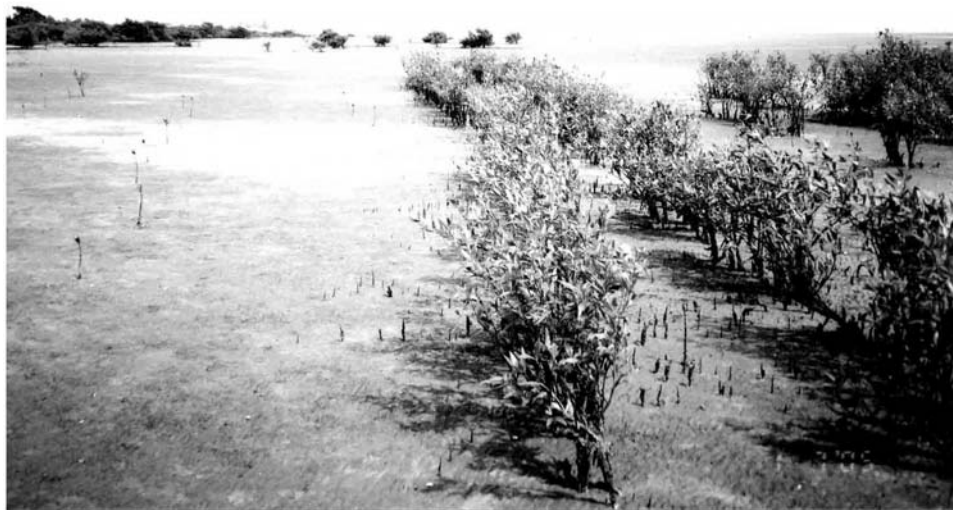
Fig. 3. One year old saplings of A. marina

To avoid crowding and over shadowing of mangrovelings in the furrows thinning is recommended after one year of growth (Fig. 3). The plants that are smaller in height and with less number of leaves may be transplanted in the open or denuded areas whereas the taller left as such. In addition this nursery will also cater to the needs for extensive plantation in other areas. This technique is also cost effective and would not be a burden on the purse of the growers.