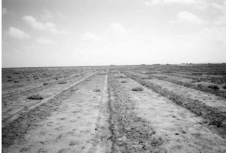
Fig. 1. Longitudinal furrows with slanting walls for growing A. marina propagules.