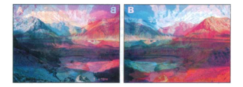
Fig. 2A. The three great Ranges meeting together. Fig. 2B. The River Gilgit merging into the River Indus near Juglot.