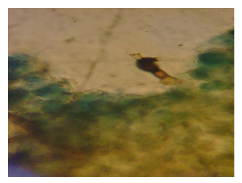
Fig. C. Z. gibbum : Strile cylindrical cell at the top of vesicle & conidiogenus cell on the pointed end (1000X).