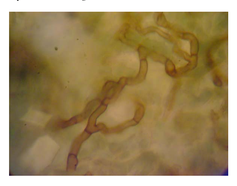
Fig. A. Z. gibbum: Septate mycelium 400X

Conidia in Z. oscheoides are ellipsoidal hyaline to pale brown, smooth to minutely verruculose 7-12 x 4-7 µm. and slightly more bigger than Z. gibbum . In Z. geminatum conidia are ellipsoidal, golden brown, verrucose and are in pairs 20–30 x 8-11 µm., which are more longer and wider than the conidia of Z. gibbum . Z. mycophilum (vuill) Sacc., conidia are ellipsoidal, hyaline, smooth 5-10 x 4-6µm., having more bigger conidia than Z. gibbum . In Z. deightonii Ellis, conidia are ellipsoidal, hyaline and smooth (9-15 x 6-9 µm), thus clearly differ from Z. gibbum .