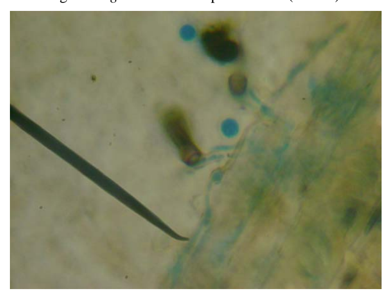
Fig. E. Z. gibbum: Spherical hyaline spore.