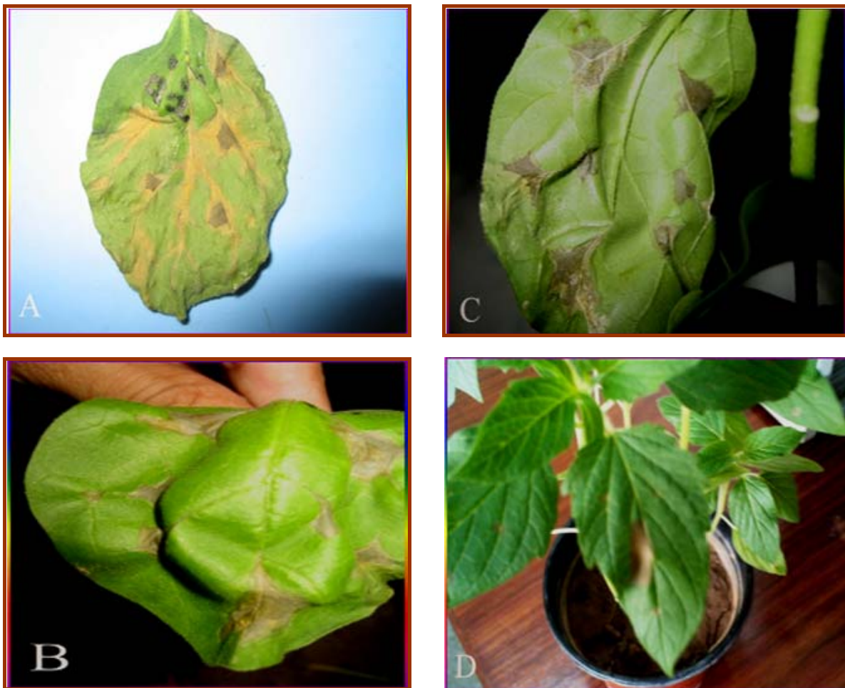
Fig. 1. Water soaking and chlorosis symptoms on brinjal due to culture filtrate of Psse-2 isolate A , necrotic due to necrotic ( Psse-1 ) producing isolates on same plant in B and water soaking in C . Xcs isolate induced blight like necrosis on sesame in D .

similarity between COR and methyl jasmonate (MeJA), a plant growth regulator, on the basis of similarity in structure and functions (Wasternack & Parthier, 1997). For example, oat leaves senescence (Ueda & Kato, 1980), inhibits arabidopsis root growth (Staswick et al. , 1992) and potato tissue enlargement (Koda et al. , 1991) were due to MeJA. In present investigation, Psse-2 isolate induced hypertrophic outgrowth in potato discs but did not induce by chl- and Xcs isolates. It is concluded that chlorosis producing symptoms was due to the action of chlorosis inducing toxin COR, and Psse-2 isolate produced phytotoxin COR as conformation was done in potato tuber assay. So present result supported the work of Sakai et al. , (1979 and 1979b) and Volksch et al. , (1989) who reported the presence of COR was characterized by enlargement of potato tissues using pure culture or culture filtrate of Psse . It is well studied that plant pathogenic microorganisms produce physiologically active compounds that can regulate the growth of plants. COR is an extracellular toxin produced by many pathovars of P. syringae and have the ability to deform the tissue and elongate the cells by water uptaking.