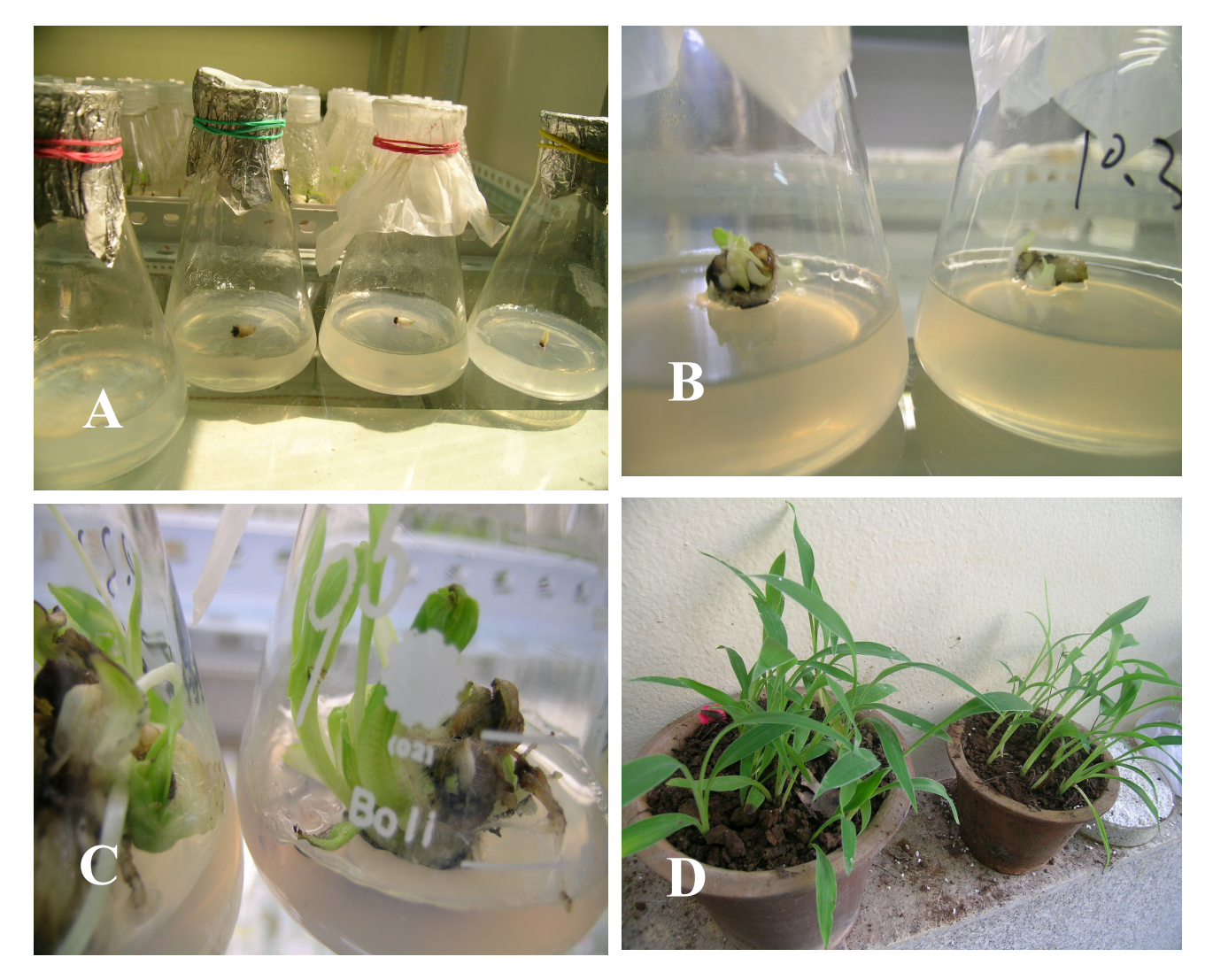
Fig. 2. In vitro embryo culture of Musella lasiocarpa and plantlets. The embryos were extracted from the seeds stratified at 23°C for 6 months. (A) proliferation culture for 7 days; (B) proliferation culture for 16 days; (C) rooting culture for 10 days; (D) plantlets grew for 38 days.

required for its growth. The embryos at the autotrophic stage can germinate and grow on a simple inorganic medium supplemented with a carbon source, such as sucrose. In this study, based on data embryo differentiation and the two-stage opinion quoted above, we evaluated the potential of In vitro embryo culture only by using the embryos from fresh seeds and ones warm stratified for 6 months. Similarly, Choi et al. (1998) also reported that competence was variable, which was related to the developmental stage of immature zygotic embryos of Chinese cabbage ( Brassica campestris subsp. napus pekinensis ). Therefore, this study confirmed that the embryo developmental stage plays a crucial role in embryo culture, at least, for this species.