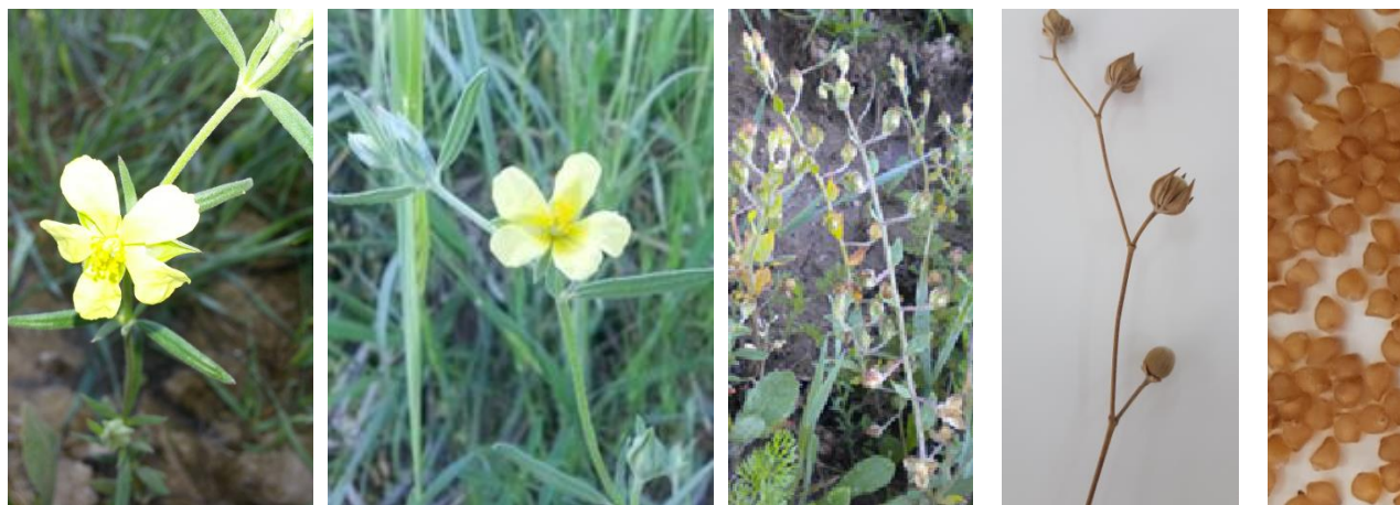
Fig. 1. Pictures taken at different periods (flower, capsule and seed) of Helianthemum ledifolium (L.) Miller var. lasiocarpum (Willk.) Bornm taxon

Climate data has been obtained from the General Directorate of Meteorology. The long-term climate data of Diyarbakir province are given in Fig. 2 (Anon., 2017c). The average monthly temperature values (15.9°C in 2015 and 16.1°C in 2016) are similar to the long term average (15.8°C), while the relative humidity values are higher than the long term average (54.1%) in the first year (59.1%) and slightly lower in the second year (52.7%). The amounts of precipitation in two years (460.3 mm in 2015 and 458.6 mm in 2016) are close to each other and lower than the long term average (490.1 mm). The amount of precipitation in March, April, and May when plants grow actively is above the long term average (180.5 mm) in the first year (193.1 mm) and below in the second year (95.8 mm).