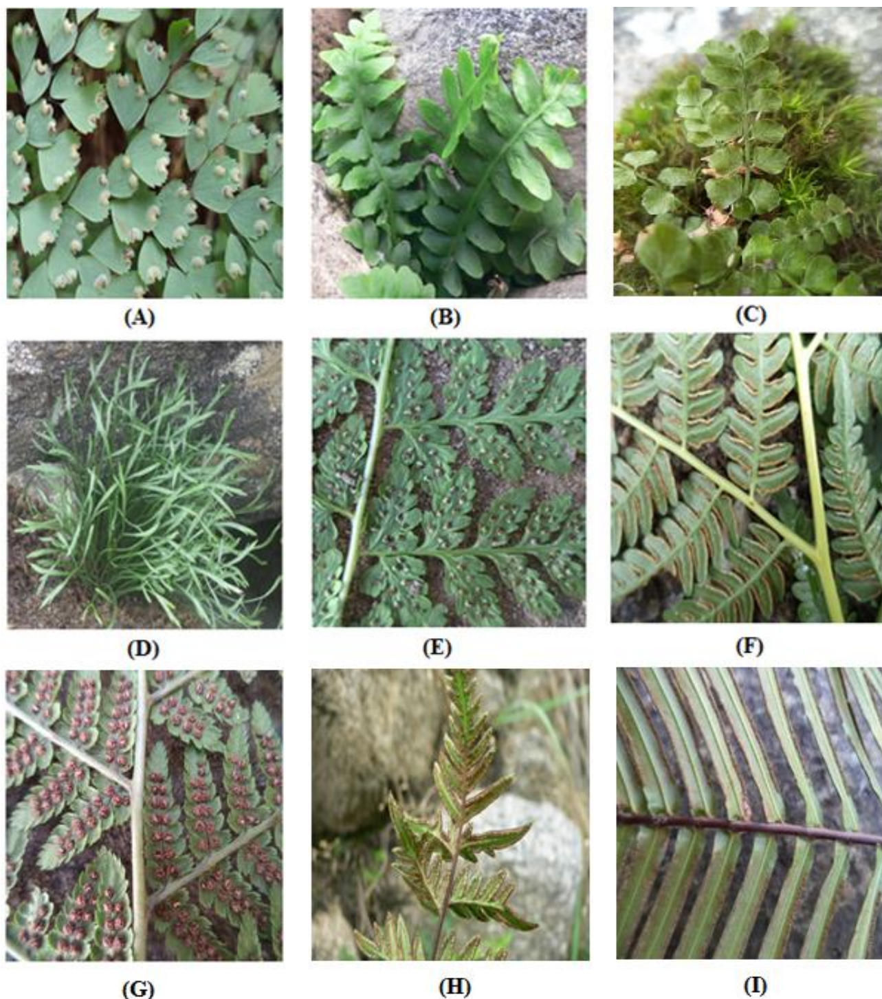
Fig. 3. (A) Adiantum venustum D. Don (B) Asplenium ceterach L. (C) Asplenium ruta-muraria L. (D) Asplenium septentrionale (L.) Hoffm. (E) Cystopteris fragilis (L.) Bernh. (F) Pteridium aquilinum (L.) Kuhn. (G) Dryopteris carthusiana (Vill.) H.P. Fuchs (H) Pellaea nitidula (Hook.) Baker (I) Pteris vittata L.

Ethnobotanical uses: Both rhizome and fronds are used as vegetable. The rhizome is also used as remedy for intestinal worms. The rhizome is roasted, peeled and the inner portion is eaten. The young fronds are boiled in water and are eaten.