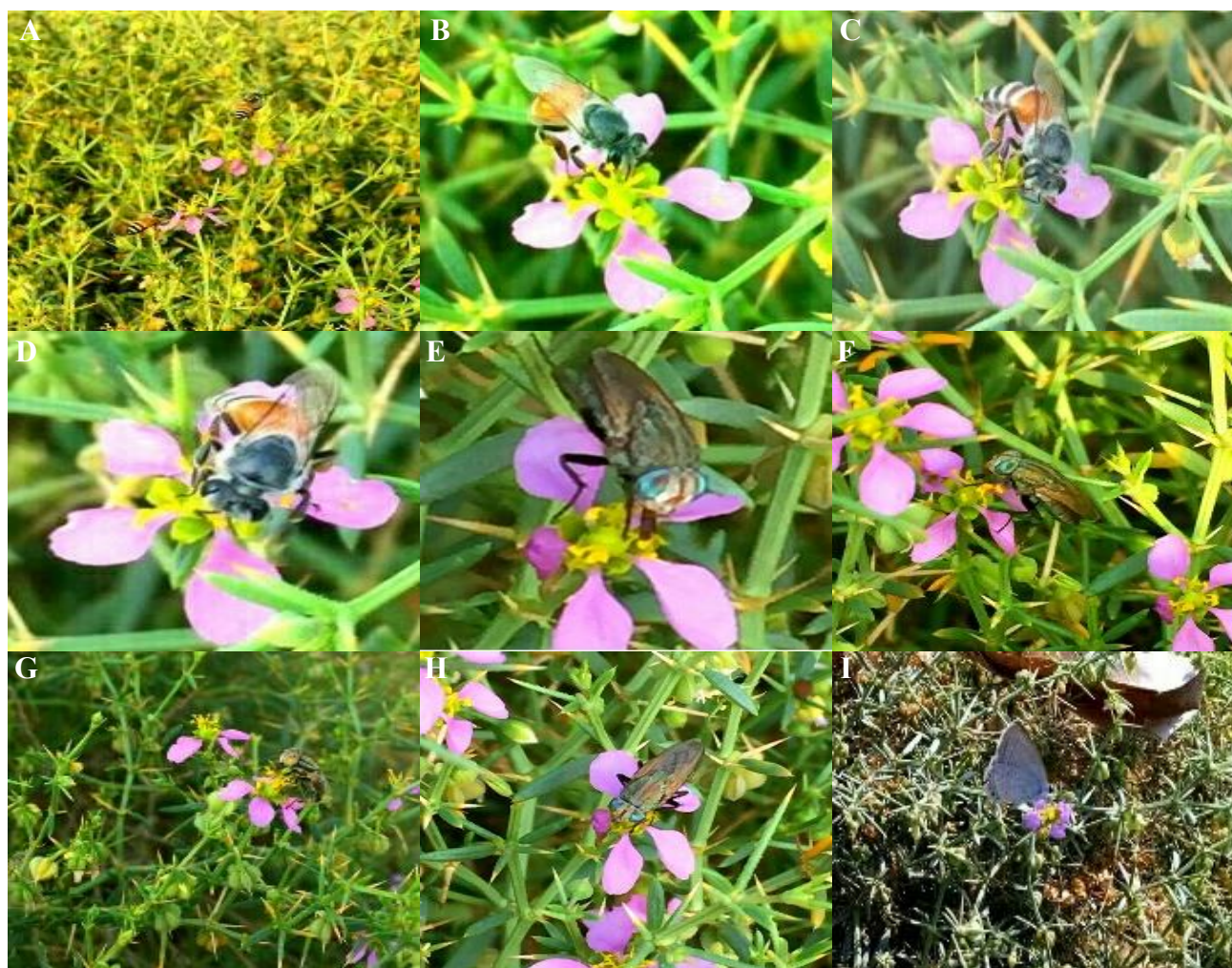
Fig. 1. Insects visiting flowers in search of food and collecting nectar. A-D, Apis mellifera ; E-H, Sarcophaga sp; I, Chilades parrhasius