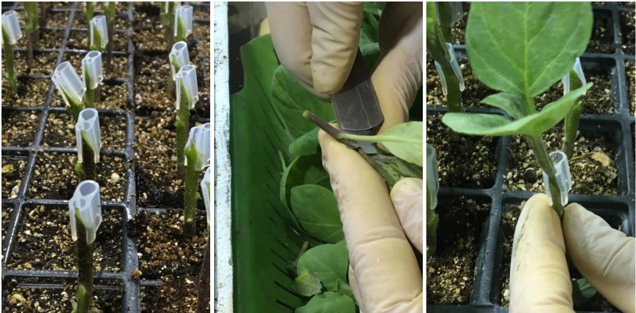
Fig. 1. a. Cutting the rootstocks just below the cotyledons at an angle of 45 degrees and inserting plastic tubes, b. Cutting the scions just below the cotyledons at an angle of 45 degrees. c. Grafting.