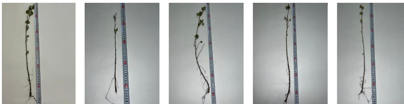
Fig. 2. First-year cuttings of Populus trees rooted in the open ground.

To determine the chlorophyll content, a month later after planting, the leaves from poplar saplings were taken in different directions of the petioles. The optical density of the acetone extract of leaf samples measured with a volume of 0.1 g in 3 replicates from the entire crushed foliage mass was measured using the SF-26 spectrophotometer in optical units. The chlorophyll content was calculated using the formula: