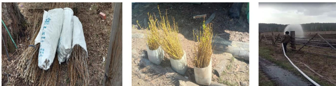
Fig. 1. Cuttings of Populus trees (before planting and watering in an open ground).