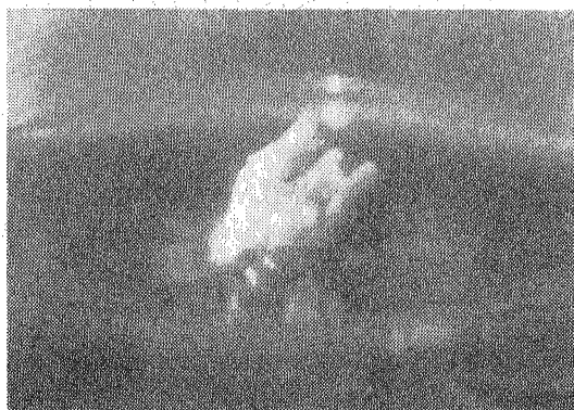
Fig. 1. Apical bud one week after culture on MS medium supplemented with 7.5 mg/l GA_3 .

washings in autoclaved distilled water. The explants were grown on modified MS medium containing activated neutralized charcoal, 0.2% sucrose 30g/l and agar 7.5g/l in 57mm x 120mm glass jars. MS medium was further supplemented with different concentrations of GA_3 (2.5 to 5mg/l) alone, or in combination with 2,4-D (5 to 10mg/l). The cultures were incubated at 26^\circ C \pm 2^\circ C , with a photoperiod of 16 h and a light intensity of 3,000 lux. For each variety tested there were 10 replicates.