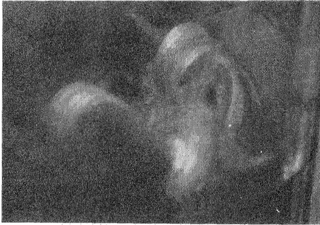
Fig. 3. Shoot formation from apical buds of cv. Dhakki within 6-8 weeks of culture on MS medium containing 1 mg/l NAA.

and showed pronounced tissue growth. After 6 weeks, the explants were subcultured on MS medium supplemented with 10mg/l NAA without activated charcoal. Vigorous shoot growth was noted in Dhakki, but no further improvement was observed in cvs., Khudrawi and Zahidi. Further subculturing of Dhakki on a nutrient medium containing 1mg/l NAA and 10mg/l NAA showed no growth, but abnormality increased with sparse root initiation.