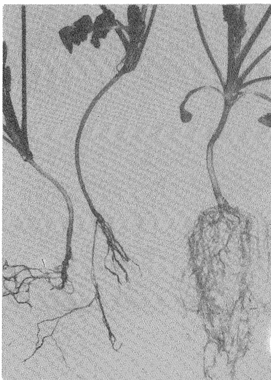
Fig.2. Infection of Phoma multirostrata on coriander showing necrotic roots (Left) compared with control plants (Right).

leaf. The spots were surrounded by a narrow, dark brown border. The lesions were covered with pycnidia that produced and liberated abundant spores. When seeds were dipped in spore suspension, up to 84.0% plants showed discoloration and decay of roots and foot region. When seedlings were transplanted in infested sand, 49.8% of plants showed infection. The infected tissues shred, break up and fall off (Fig.2). Infected lesions on the stem, lower leaves and petioles became apparent in traces which kept spreading to the inner whorls of the crown (Fig. 3). Within 6 weeks 45.0% of the plants became infected and the disease incidence increased showing one to several lesions on the stem and large coalesced lesions on leaves and petioles. This is the first report of P. multirostrata on coriander from Pakistan. P. multirostrata has been reported from Lilium sp. (Chandra & Tandon, 1965), Mangifera indica , Chrysanthemum (Dorenbosch & Howeler, 1968), Cestrum nocturnum and Musa paradisiaca (Rai & Rajak, 1986). The fungus is ubiquitous in Africa and South France (Dorenbosch & Howeler, 1968) but in temperate regions it is found only in green houses and is apparently a thermophilic species (Dorenbosch & Boerema, 1973).