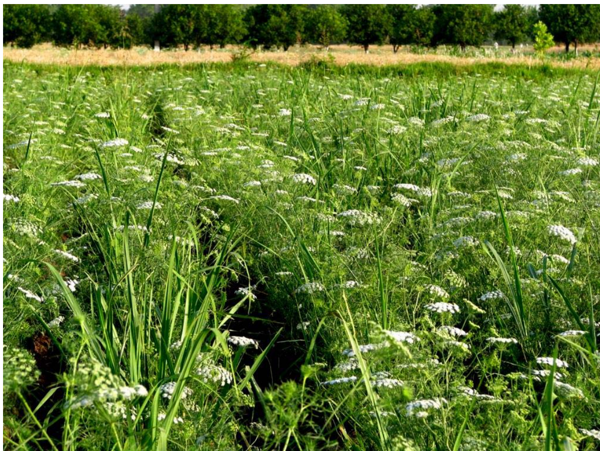
Fig. 1. A. visnaga infesting a sugarcane field. Inset shows the inflorescence of A. visnaga .

Ethnobotany of A. visnaga : A. visnaga has been commonly used for colic and gastrointestinal cramps, kidney stones and painful menstruation (Bisset, 1994). Also, A. visnaga is used in the treatment of mild angina. Further, it is used as a supportive treatment in the respiratory conditions such as asthma, bronchitis, cough and whooping cough (Farnsworth, 2001; Anon., 2007). A. visnaga is also used in the cardiovascular disorders for example hypertension, cardiac arrhythmias, congestive heart failure, atherosclerosis and hypercholesterolemia (Rose & Hulburd, 1992; Satrani et al. , 2004). Moreover, it is used as diuretic and for relieving liver and gall bladder disorders (Anon., 2007). When applied topically, A. visnaga has been found useful in the recovery of vitiligo, psoriasis, wound healing, inflammation conditions, and poisonous bites (Abdelfattah et al. , 1983; Valkova et al. , 2004).