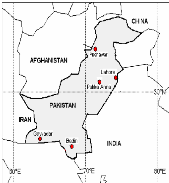
Fig. 1. Selected study sites in Pakistan.

A survey was conducted to select established salt tolerant plantations of different ages in different ecological zones of Pakistan ( lat. 24° and 37°N and long. 61° and 76°E) to estimate their biomass characteristics. Climatically, Pakistan can be divided into 36 ecological zones. For biomass estimation of established salt tolerant tree species, following five sites were selected all over the Pakistan, two in Punjab and one each in other three provinces (Fig. 1).