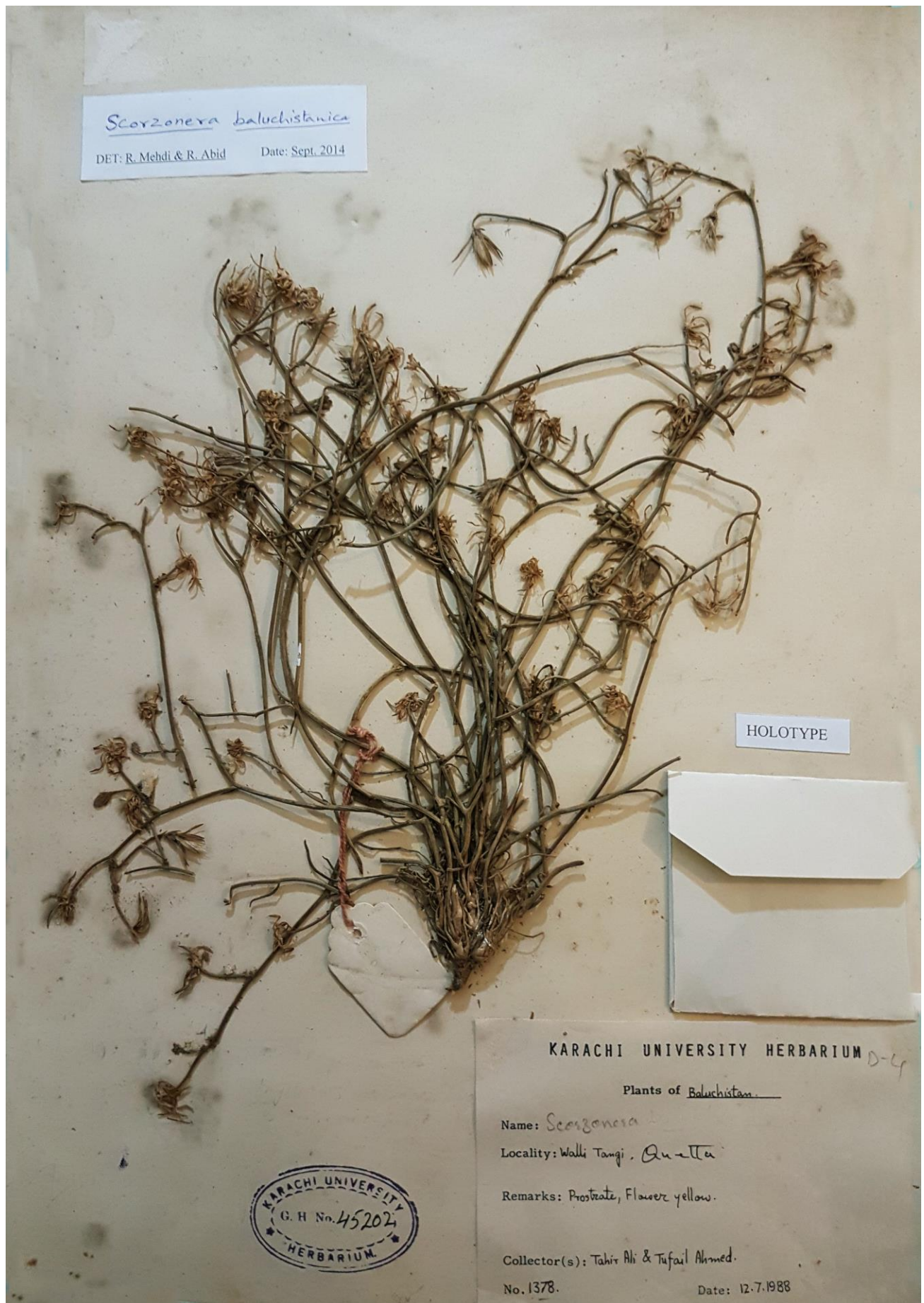
Fig. 1. Type specimen of Scorzonera baluchistanica .