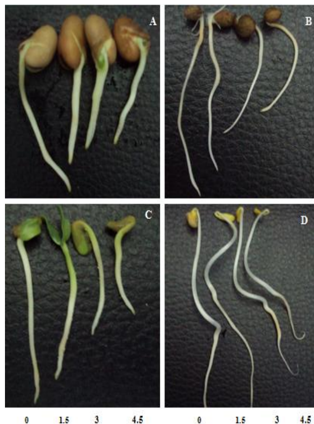
Fig. 1. Morphology of Vicia faba (A), Vicia sativa (B), Trigonella foenum-graecum (C) and Medicago truncatula (D) roots under different copper sulphate concentrations (0, 1.5, 3 and 4.5 g/l CuSO 4 ).

reduction is less pronounced in V. sativa and T. foenum-graecum (17% and 16%, respectively). However, it reaches 47% and 50%, respectively, for V. faba and M. truncatula .