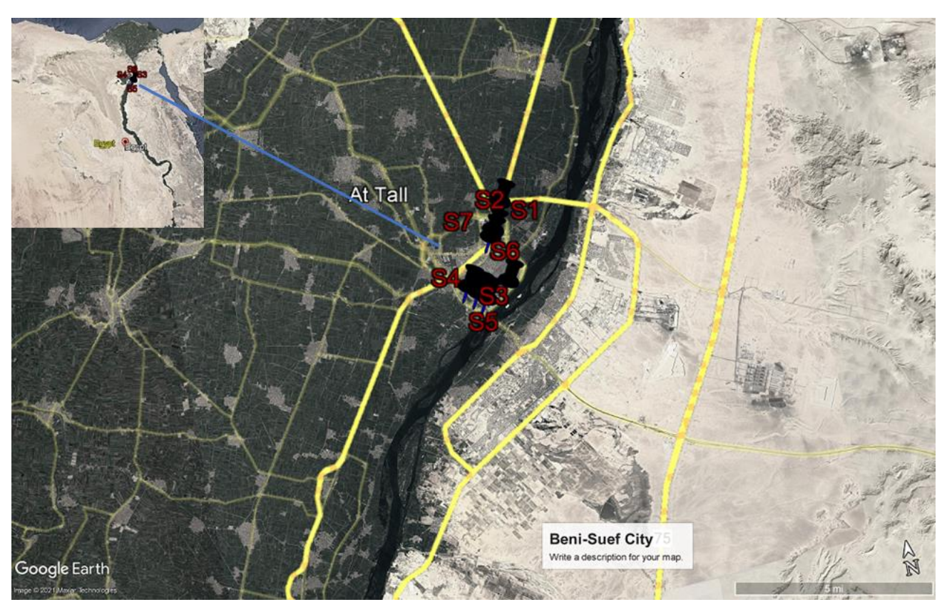
Fig. 1. Distribution map of the studied city.

Life forms: Seven life forms were recorded in the current study (Fig. 2b). The majority of species (40 species, ca. 70%) were therophytes, followed by hemicryptophytes (6 species, ca. 10%), then geophytes (5 species, ca. 9%), but chamaephytes and phanerophytes were represented by an equal number of species (2 species, ca. 4%). In addition, hydrophytes and geophyte-halophytes were represented by one species each ( ca. 2%).