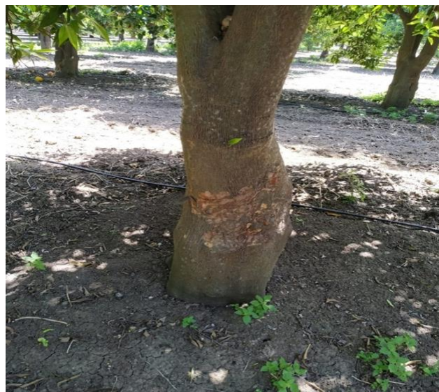
Fig. 1. Bark spalling on citrus stem which infected CPV.

Total nucleic acid extraction: Young leaves which showed virus symptoms were used in tNA isolation studies. Samples were extracted by diluting 1:4 (w/v) with extraction buffer (100mM Tris-HCl pH.8.0, 50mM EDTA b-pH. 7.0, 500 NaCl, 10mM 2. mercapto-ethanol (1/1000) and the plant sap was filtered through sterile cheesecloth. 1 ml of plant sap was taken and placed in eppendorf tubes. Samples were centrifuged at 4,000 rpm for 3 minutes. 50 µl of Sodium Dodecylsulfate (20%) was added to the c-Pellet and mixed in a vortex, and then the tubes were