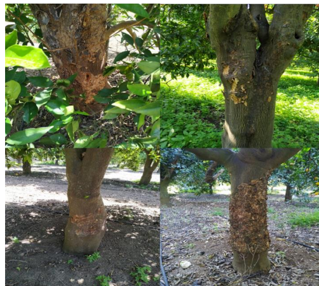
Fig. 2. Trees of samples which showed positive results.

PCR analysis results showed, samples numbered 33, 34, 35, 40 were positive about Citrus Psorosis Virus pathogen (Fig. 2). Electrophoresis results showed the positive samples were obtained in c, d, f, h lines at 600 bp (Fig. 3).