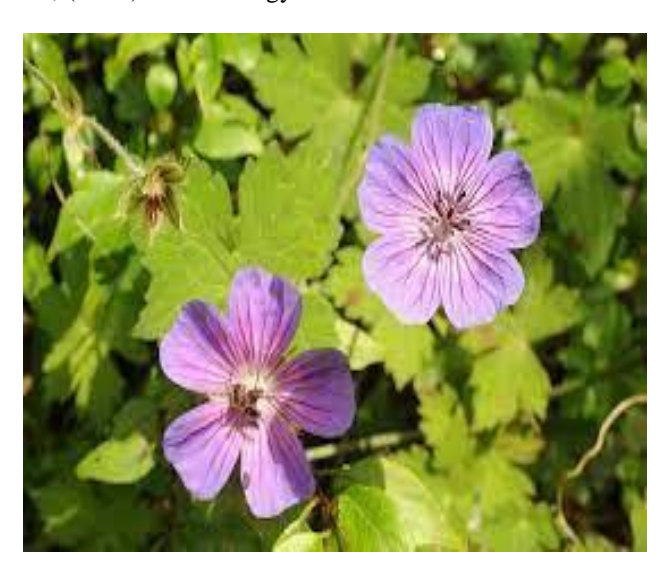
Fig. 1. Geranium wallichianum with flowers.

at the Central Hi-Tech Laboratory, University of Poonch Rawalakot, Pakistan. The process recommended by the Association of Official Agricultural Chemists (AOAC, 2000) was divided into two parts, with the sample being digested using nitric-perchloric acid. In the 1<sup>st</sup> phase, 250ml capacity beaker was taken and one gram of wet sample and concentrated HNO<sub>3</sub> (10ml) were taken. Hot plate (Model) was used to boil the mixture to oxidize all easily oxidizable materials for 30-45 min. The liquid was then allowed to cool before being re-heated with 70% HClO<sub>4</sub> (5ml) until thick white vapors formed. After cooling, distilled water (20mL) was added, and the liquid was heated one more time to remove any odours. After chilling the solution, the filtrate was prepared in a 50mL volumetric flask using Whatman No. 42 filter paper and <0.45 mL filter paper, and the filtrate was diluted to 50mL with distilled water. In 2<sup>nd</sup> phase, after digestion, an atomic absorption spectrometer (AAS) was used to quantify heavy metals (µg g-1) including Magnesium (Mg), Zinc (Zn), Iron (Fe), Calcium (Ca), Arsenic (As), Cupper (Cu), Phosphorus (P), Cadmium (Cd), Lead (Pb) and Mercury (Hg) using the Colagar et al., (2009) methodology.