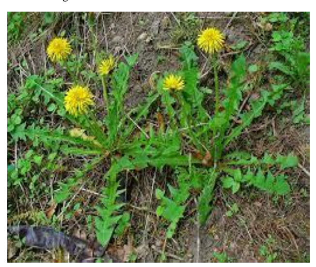
Fig. 3. Taraxacum officinale with flower.

DNA damage prevention test: As indicated by Tian and Hua (2005), a DNA damage prevention test was conducted Calf thymus DNA (Ct DNA) was treated with 3\mu l of ferrous sulfate (2 mM), 5 l of Fenton reagent (30 percent (v/v) hydrogen peroxide (4\mu 1) , and 5 \mu l of all examined medicinal plant extracts (100 \mu g/ml), in that order. Then, the DNA on agarose gel electrophoresis was run as control DNA (untreated), treated DNA (2 mM FeSO4 + 30 percent H<sub>2</sub>O<sub>2</sub> + 1 mM Quercetin), treated DNA (2 mM FeSO4), treated DNA (30 percent H<sub>2</sub>O<sub>2</sub>), and treated DNA (2 mM FeSO4 + 30 percent H_2O_2 + 5 \mu l of respected medicinal plant extract), to evaluate the DNA damage protection capacity of selected plant extracts. Following mixing, all reaction solutions were preheated to 37°C for 60 minutes before running. 3 \mu l of bromophenol blue was then added as a loading dye. The electrophoresis was performed using a 1 percent (w/v) agarose gel in TAE buffer (1X TAE buffer was used as the mobile phase in the electrophoresis) at 85 V at room temperature for 45 min. To see the results, the gel was afterwards stained with ethidium bromide. To document the gel, a Syngene Gene Genius Gel Light Imaging System was employed.