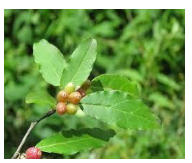
Fig. 2. Elaeagnus parvifolia with fruits.

DNA damage prevention test: As indicated by Tian and Hua (2005), a DNA damage prevention test was conducted Calf thymus DNA (Ct DNA) was treated with 3\mu l of ferrous sulfate (2 mM), 5 l of Fenton reagent (30 percent (v/v) hydrogen peroxide (4\mu 1) , and 5 \mu l of all examined medicinal plant extracts (100 \mu g/ml), in that order. Then, the DNA on agarose gel electrophoresis was run as control DNA (untreated), treated DNA (2 mM FeSO4 + 30 percent H<sub>2</sub>O<sub>2</sub> + 1 mM Quercetin), treated DNA (2 mM FeSO4), treated DNA (30 percent H<sub>2</sub>O<sub>2</sub>), and treated DNA (2 mM FeSO4 + 30 percent H_2O_2 + 5 \mu l of respected medicinal plant extract), to evaluate the DNA damage protection capacity of selected plant extracts. Following mixing, all reaction solutions were preheated to 37°C for 60 minutes before running. 3 \mu l of bromophenol blue was then added as a loading dye. The electrophoresis was performed using a 1 percent (w/v) agarose gel in TAE buffer (1X TAE buffer was used as the mobile phase in the electrophoresis) at 85 V at room temperature for 45 min. To see the results, the gel was afterwards stained with ethidium bromide. To document the gel, a Syngene Gene Genius Gel Light Imaging System was employed.