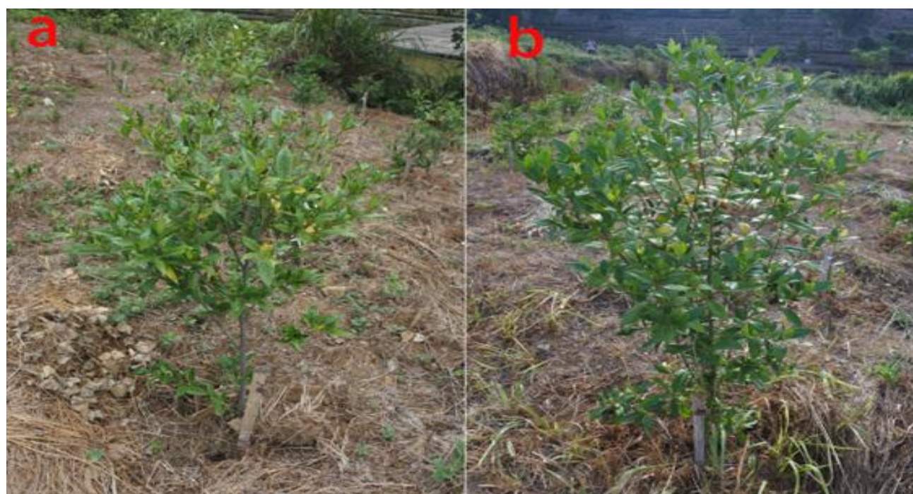
Fig. 3. The elite individuals screened N.B.: a. The plant of Min Lin Zhi No.8; b. The plant of Min Lin Zhi No.10