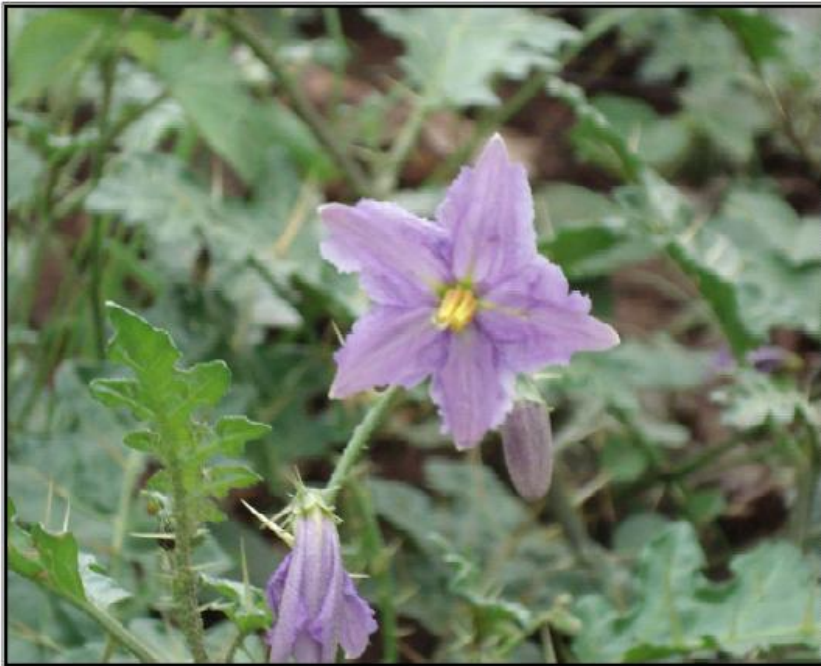
Fig. 1. Solanum surattense Burm with purple flowers.