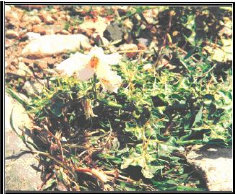
Fig. 2. Solanum surattense Burm with purple flowers.