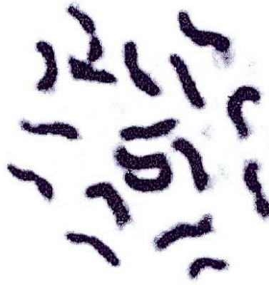
Fig. 1a. Somatic metaphase chromosomes of Kalidiopsis wagenitzii

Chromosome numbers were obtained from somatic mitosis of root tips of the radicula. The diploid chromosome number of Kalidiopsis wagenitzii was found to be 2n=18 (Fig. 1). Nine pairs of homologues were identified from the morphology of the chromosomes (Fig. 2).